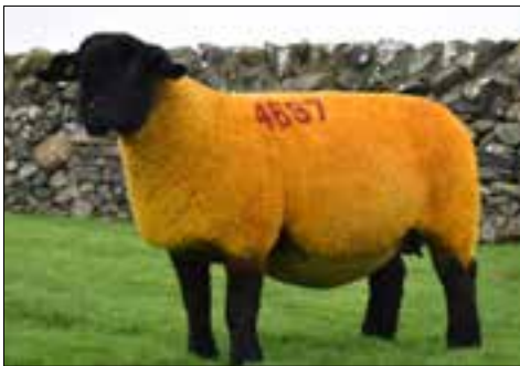
4000GN GIMMER SOLD AT THE DARK DIAMONDS SALE 2022 TO THE FORKINS FLOCK

Four of the five lots forward are all from the same family as out 4000gn gimmer sold to the Forkins flock at the Dark Diamonds sale 2022 and the 4000gn and 2600gn gimmers sold to the Harpercroft and Sharps flocks at the Dark Diamonds sale 2021. This is one of the strongest breeding lines in the flock with over 75% of our breeding females going back to JKA:17:03167.