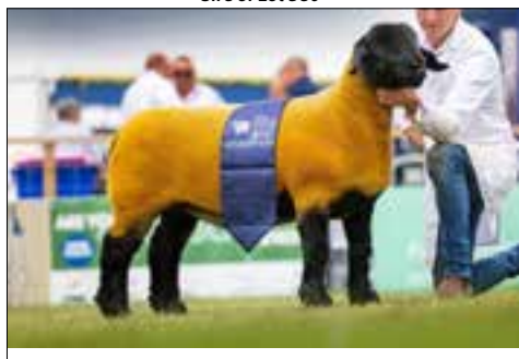
MAIDENSTONE WHU:22:01402 Dam of Lot 580

Without a doubt one of the best families in the flock. Maternal sister bred this years RHS Champion. Sisters sold for 3500gn and 2300gn. Family includes 68,000gn King of Diamonds.