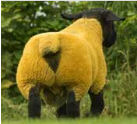
FULL BROTHER TO LOT 541 SOLD FOR 18,000GN

Full brother sold for 18,000gn. Full sisters have sold to 10,000gn, 4500gn, 3800gn and 3200gn as ewe lambs. Dam is maternal sister to 20,000gn Dizzie Rascal.