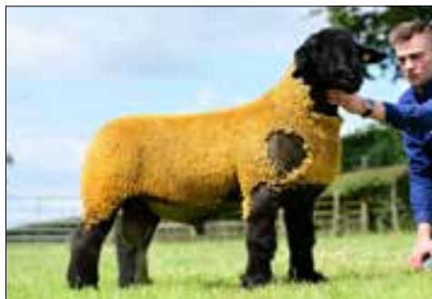
CASTLEISLE BLACK ADDER Sire of Lot 580