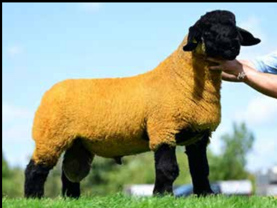
CARONY CHA-CHING 19,000GN