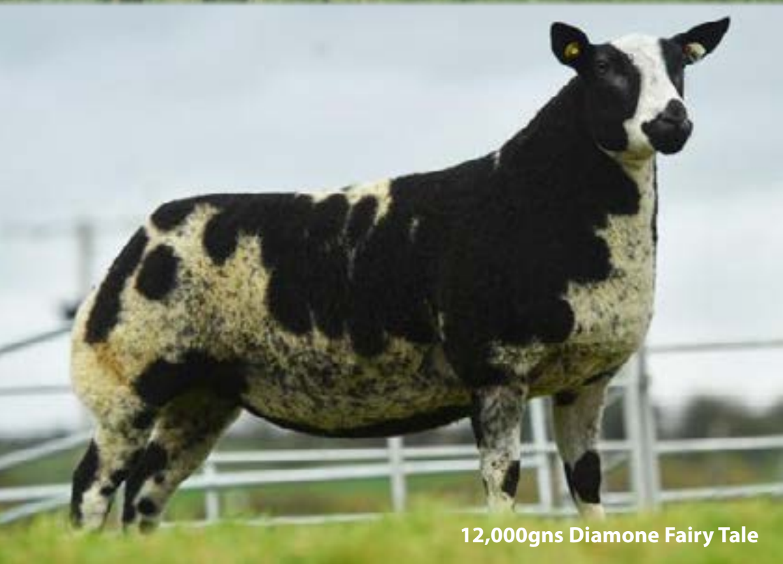
12,000gns Diamone Fairy Tale