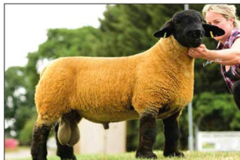
ROOKERY MEAN MACHINE

Purchased at Shrewsbury 2022. Bred very well in his first year, with a son being one of the service sires at Burnviews dispersal sale.