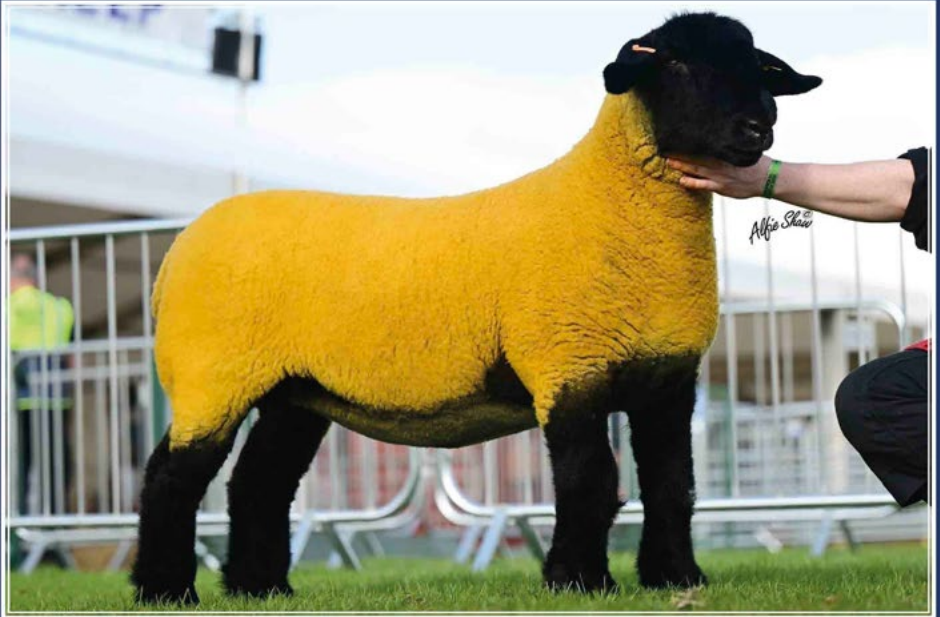
BALMORAL SHOW CHAMPION 2023