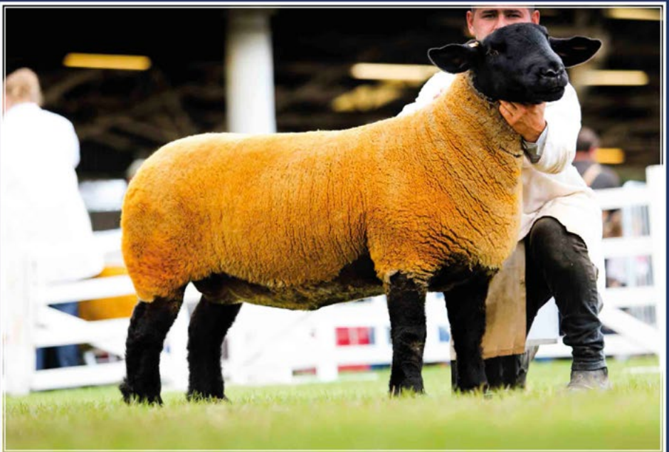
GREAT YORKSHIRE SHOW CHAMPION 2023