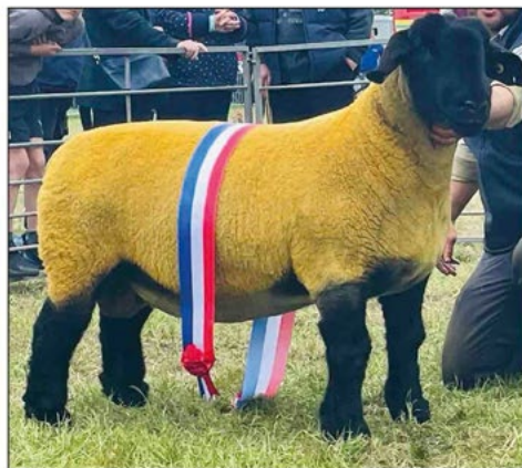
DAM OF PHOENIX