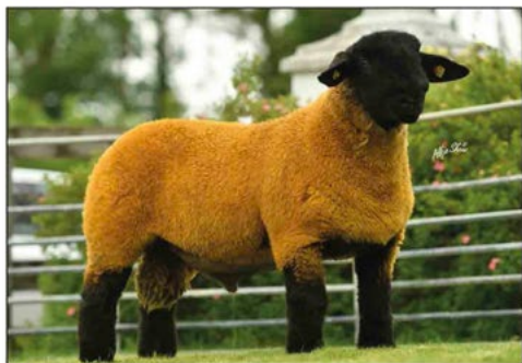
CASTLEISLE A KINGSMAN

This lad has bred exceptionally well with his ram lambs topping at £16000gns with multiple sons making four figures upwards. An Absolute Powerhouse!