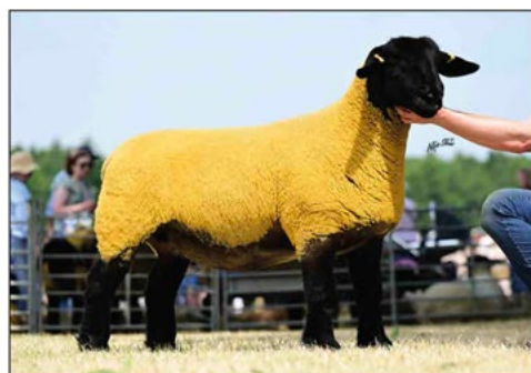
ET SISTER TO LOT 425