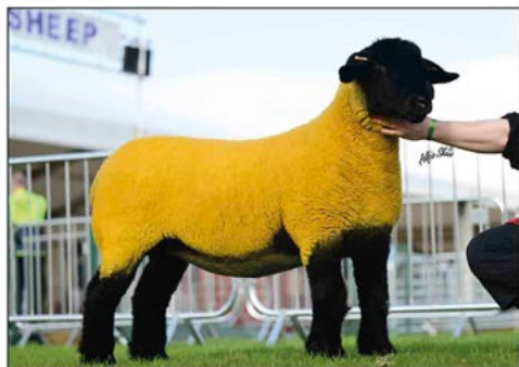
ET SISTER TO LOT 424