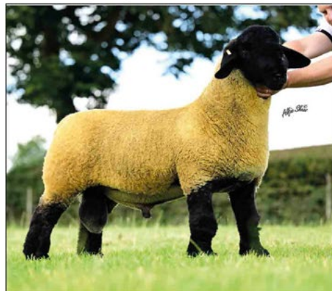
LAKEVIEW 1 UP

Lakeview 1 Up was purchased for 52,000gn with the Sportsman's flock at Lanark.