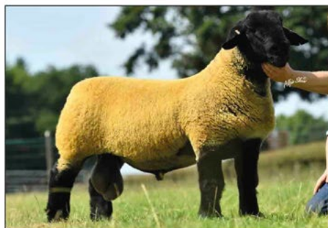
STRATHBOGIE NEVER SAY NEVER

gs: Crewelands Kingpin (PWN:18:01027) gd: Strathisla (FNV:13:144) gs: Castleisle Knockout (DDX:15:00933) gd: Deveronside NAJ:11:024)