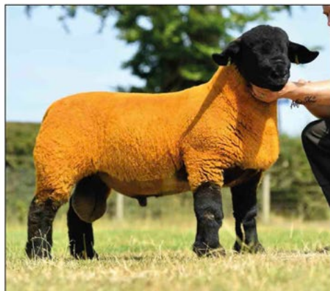
8000GN SALOPIAN ZOOLANDER (SIRE OF THE TWO MIDDLEMUIR GIMMERS) SIRE OF LAMBS TO 1000GNS