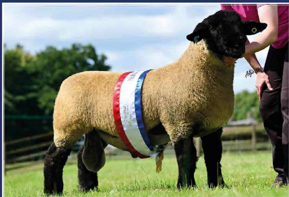
LANARK CHAMPION 2023