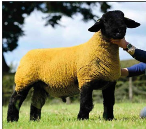
BALLYNACANNON IRON MIKE

Purchased for 8,000 along with Limestone, Castleisle and Oakbridge. Purchased for his great power and head. These are the first females offered in lamb to him