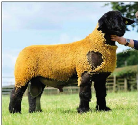
CASTLEISLE BLACK ADDER