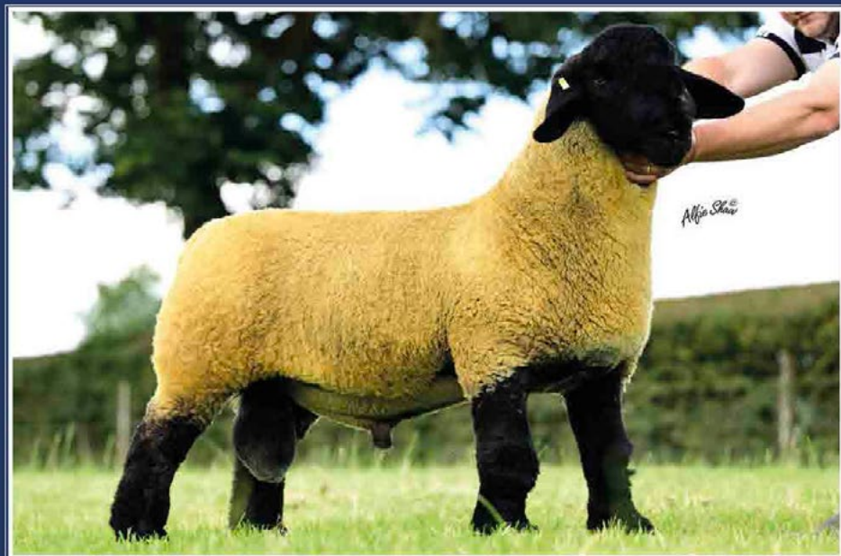
LAKEVIEW 52,000gns Lanark top price suffolk 2023