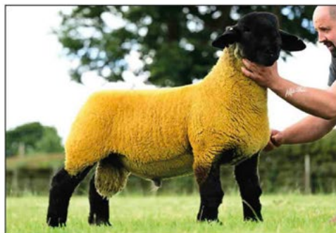
BALLYNACANNON FLASH MAN

gs: Salopian Scuderia (V87:19:00614) gd: Lakeview (JFF:17:02679) gs: Birness Muzza (1W:19:02405) gd: Ballynacannon (KKW:16:00736)