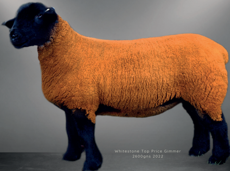
Whitestone Top Price Gimmer 2600gns 2022

Lanark Agricultural Centre | Hyndford Road | Lanark | ML11 9AX