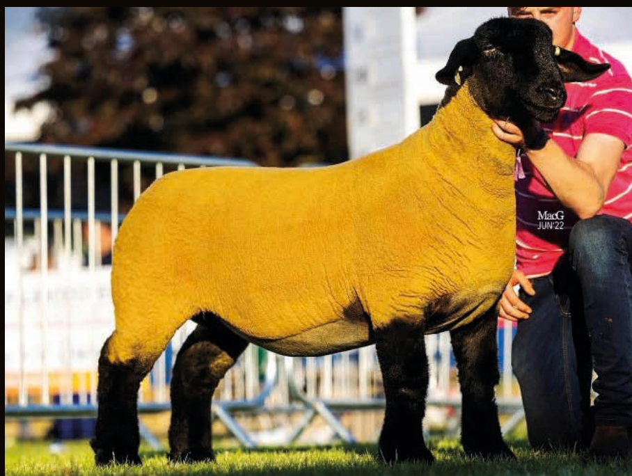
MAIDENSTONE RHS CHAMPION 2022