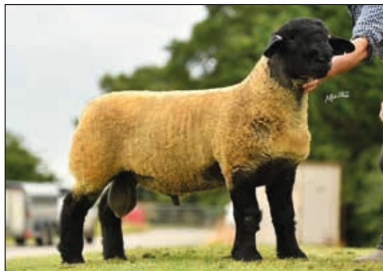
STRATHBOGIE GHOST RIDER

Purchased for 12,000gns Shrewsbury 2021. He has bred rams to 5000gns. A real modern ram, and has done a real job in his first year with just a few lambs out of him.