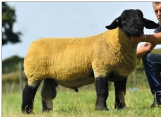
STRATHBOGIE MAGIC MIKE

Strathbogie Magic Mike was purchased for 8500gns Lanark 2021 for his size, body and power. Sons have already sold to 12,000gns, 3000gns and 2000gns, with daughters to 3000gns.