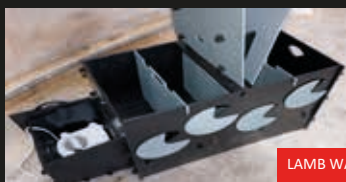
LAMB WARMING BOX