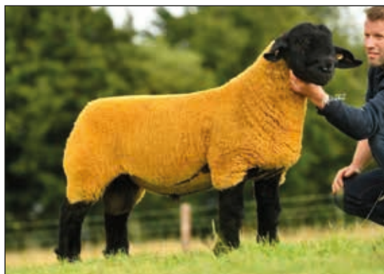
BALLINATONE SHOW STOPPER

€44,000 Blessington 2021, he won Male Champion and Reserve Breed Champion RUAS 2022. His first son sold for 7500gns.