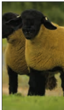
BALLYNACANNON HAKUNA MATATA

The top lamb in the Ballynacannon flock last year, purchased at the Northern Ireland Premier Ballymena Sale for 13,000gns. This lamb is a total outcross to the Breed, he has bred super females and has been used across the entire flock this year.