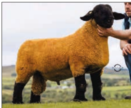
BENEDYGLEN BLACK CAVIAR

Purchased jointly with the Pyeston and Claycrop flock for 5500gn at Lanark 2020. Black Caviar is from the same family as 13,000gn Burnview Barracuda and is sired by 43,000gn Birness Muzza.