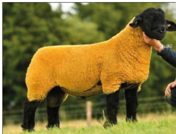
BALLINATONE SHOW STOPPER