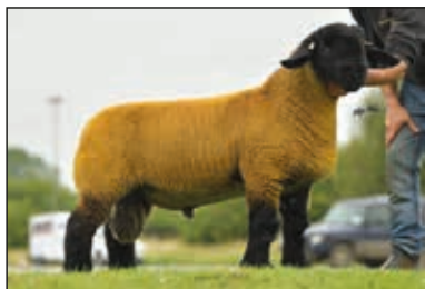
TOLGUS PRETTY BOY