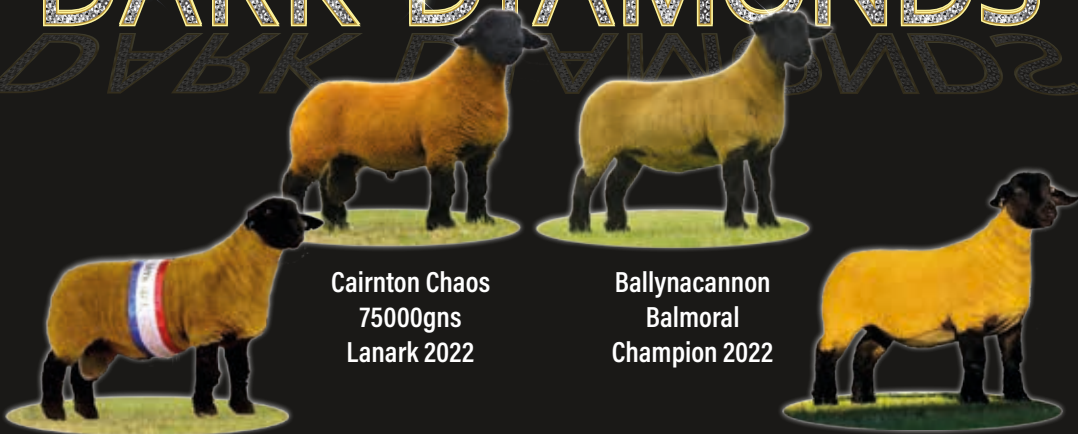
Birness Shrewsbury 2022 Champion