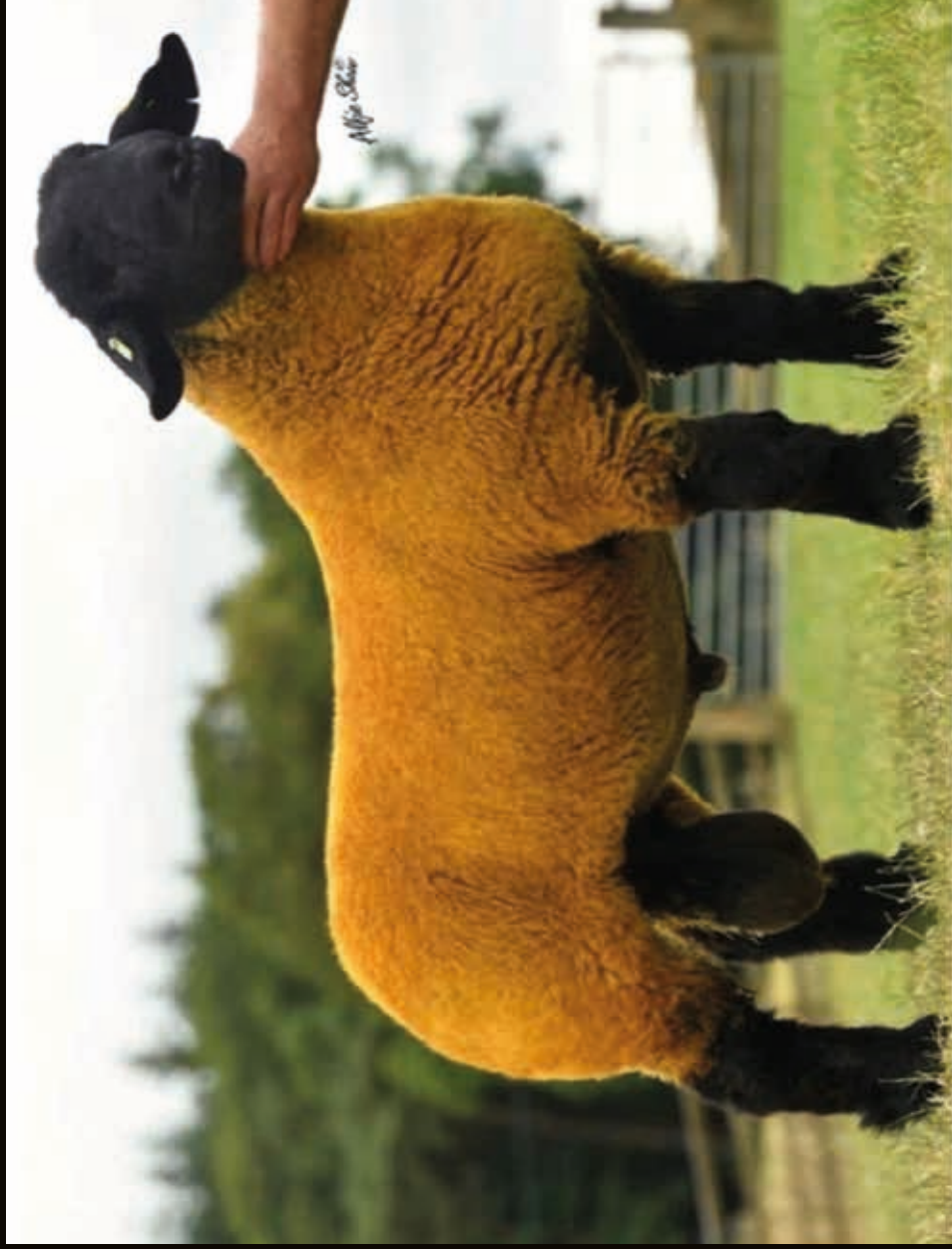
CAIRNTON LAMB SOLD FOR 75000GNS AT LANARK