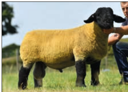
STRATHBOGIE MAGIC MIKE

STRATHBOGIE MAGIC MIKE SUT:21:05864 (102603) SINGLE ET 09 Jan 2021 Sire: Strathbogie Twenty Twenty (SUT:20:04662) gs: Crewelands Kingpin (PWN:18:01027) Dam: Strathbogie (SUT:15:01244) gd: Strathisla (FNV:13:144) gs: Muirton One Direction (K14:14:00892) gd: Deveronside (NAJ:L9)