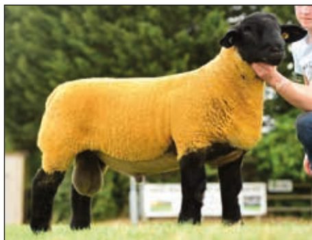
BALQUHAIN PDN 22 01324 SOLD FOR 4,200GNS

He was sire for Balquhains Shrewsbury lambs this year winning first prize in the Elite Commercial class. Lambs then went on to sell to a top of 4,200gns and having an average of £2835 for all 3 sold with was one of the top averages on the day. Balquhain PDN 22 01324 sold for 4,200gns. He also breeds tremendous commercial lambs. His lambs were very much admired at Kelso rams sale this year and again we were in the top 5 averages.