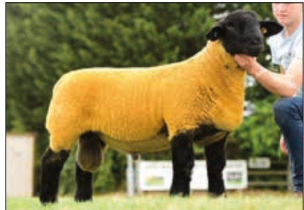
BALQUHAIN PDN 22 01324 SOLD FOR 4,200GNS

He was sire for Balquhains Shrewsbury lambs this year winning first prize in the Elite Commercial class. Lambs then went on to sell to a top of 4,200gns and having an average of £2835 for all 3 sold witch was one of the top averages on the day. Balquhain PDN 22 01324 sold for 4,200gns. He also breeds tremendous commercial lambs. His lambs were very much admired at Kelso rams sale this year and again we were in the top 5 averages.