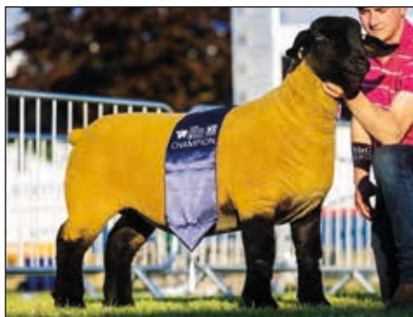
MAIDENSTONE WHU 21 01273