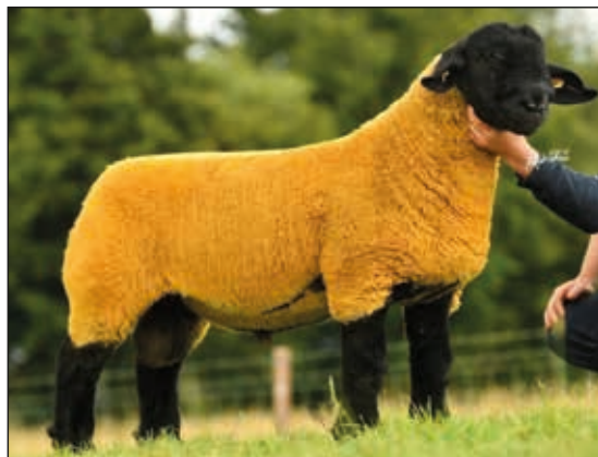
BALLINATONE SHOW STOPPER

€44,000 Blessington 2021, he won Male Champion and Reserve Breed Champion RUAS 2022. His first son sold for 7500gns.