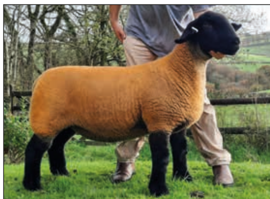
7000GNS EWE LAMB SOLD TO THE SALOPIAN FLOCK IN 2021

All enquiries welcome, please call Robin on 07851 002416 Or message Emma on Facebook