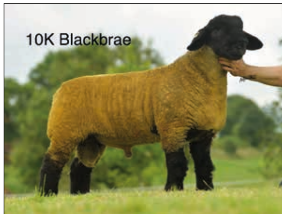
BLACKBRAE BLACK LABEL

Sire: Solwaybank Sapphire 2 (FHT:17:01448)