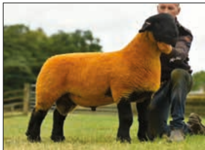
SPORTSMANS 5 STAR

Purchased for 13,000gns Lanark 2022, a son of the record breaking Salopian Solid Gold.