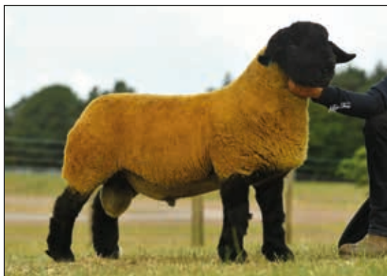
BIRNESS BLUE STEEL

Purchased Lanark 2022 with the Middlemuir flock. Maternal brother to 10,000gn Birness Hustler and gdam bred 30,000gn Birness Playboy.