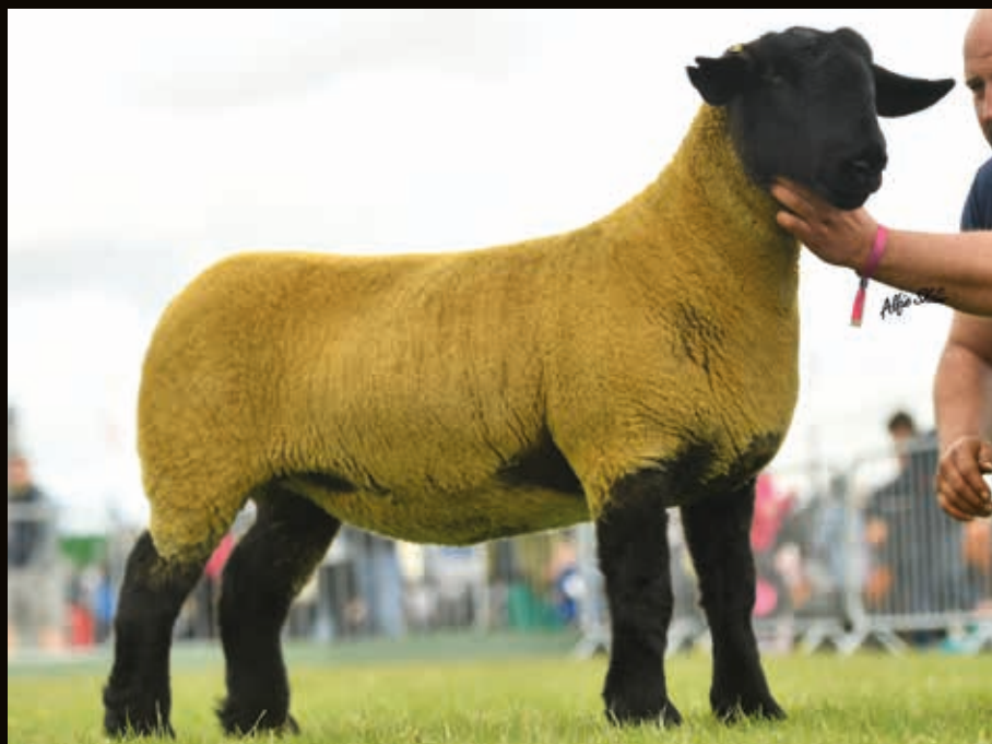
BALLYNACANNON GIMMER BALMORAL CHAMPION 2022