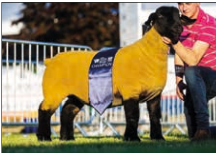
MAIDENSTONE WHU 21 01273

Purchased Lanark 2020 for 5,500gns. He was purchased for his great presence colours skin and correctness. He has breed tremendously well for every flock he has been used in. He was the sire of Maidenstones RHS Champion gimmer this year Maidenstone WHU 21 01273.