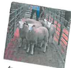
Annual Lleyn Society Show & Sale