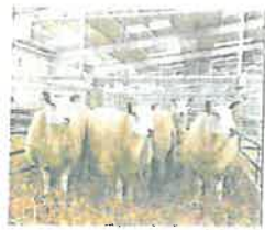
Multibreed Ewe Lamb Sales