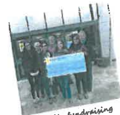
Charity fundraising by staff at WLS