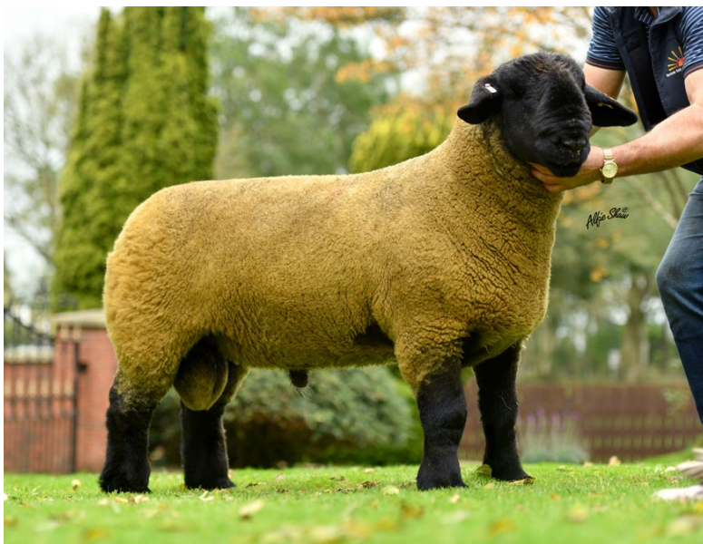
Limestone Paddywhack, the service sire of the Donrho flock