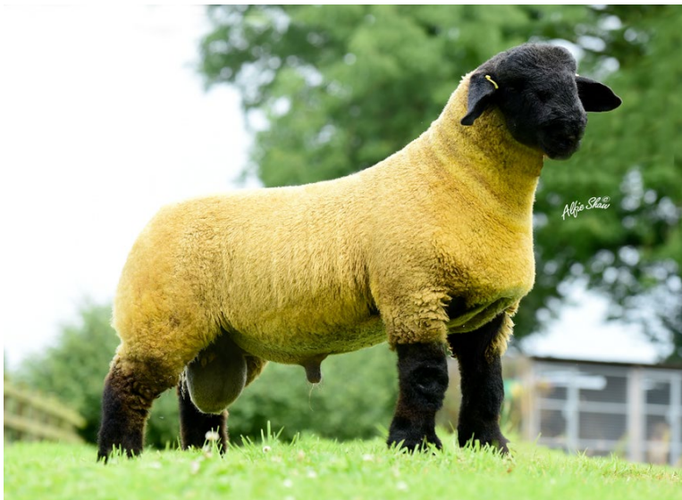
Lakeview Heart of Gold. New record price for a Suffolk Ram Lamb in Northern Ireland – 13,000 gns. It has bred exceptionally well. Sire of gimmers on sale.