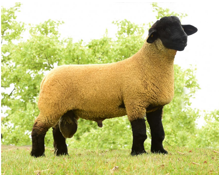
Errigal Hard Rock. Highest priced Ram Lamb sold in Ireland 2018 and sire of this year's Flock Competition progeny group.